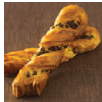
Suggestion of presentation